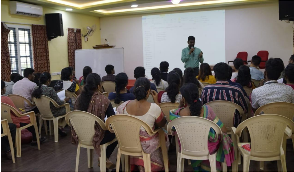
The students attending research workshop

the second session, the trainer focused on practical about research in detail and how to use all the methods in the research. To acquire expertise in identifying appropriate qualitative tools for different types of research objectives